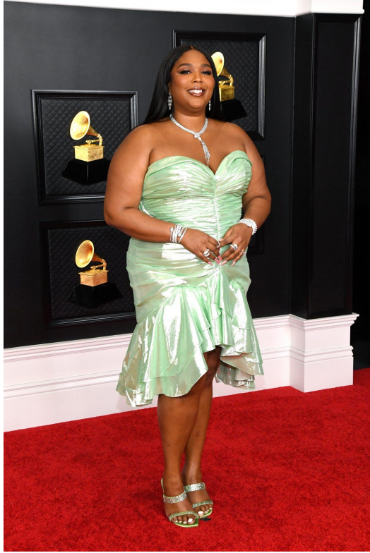
Lizzo wearing Balmain

I really loved this look! First of all, I loved the color on her, I thought it was stunning. I love Lizzo and honestly, anything she does is great. And seeing her struggle opening the envelope during the ceremony was so funny. I really love the neckline, the jewelry, it's one of my favorite looks of the night and one of the best.