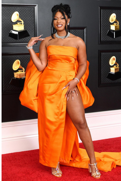
Megan Thee Stallion wearing Dolce & Gabbana

Let's talk about the GRAMMYS red carpet. The 63rd GRAMMYS were last Sunday and I have so many thoughts about the fashion. I was excited to watch them in the first place because my favorite artists were nominated, and the outfits did not disappoint.