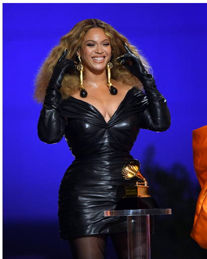
Beyoncé wearing Schiaparelli

I really loved this look! First of all, I loved the color on her, I thought it was stunning. I love Lizzo and honestly, anything she does is great. And seeing her struggle opening the envelope during the ceremony was so funny. I really love the neckline, the jewelry, it's one of my favorite looks of the night and one of the best.